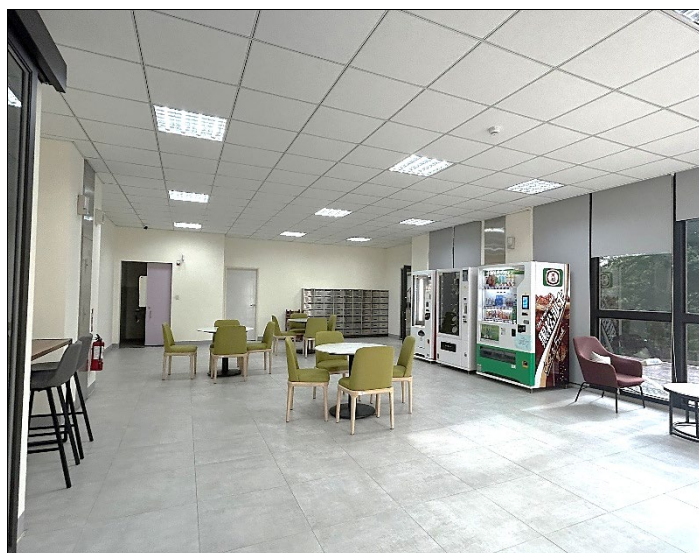
1F female lobby